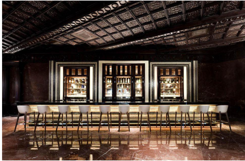
The Rum Bar, staffed by award-winning mixologists, serves classic rum drinks.

"We are bringing back the late fifties Havana-style when everyone dressed up elegantly," Smith explains, adding that in the lobby bars, all of the bartenders wear white tuxedos with black piping while the waitresses wear long flowing skirts with white blouses.